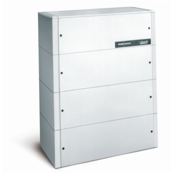
Modular Rack with Panels

C&D's modular racks provide a flexible, efficient method for racking Liberty Series 1000 batteries. These attractive, durable racks provide accessibility to the batteries and are easy to install. Racks are available in 29 inch (73.7 cm) and 43 inch (109.2 cm) lengths and are stackable. Optional panels are available to completely enclose racks, providing a cabinet-like appearance. Please see 12-380 for more information. Complete standby power systems from C&D include batteries, racks, and electronics.