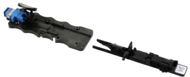
3M™ No Polish Connector Assembly Tool

Cross-sectional view of actuated spliceAfter the fiber is inserted, the assembly tool depresses the cap to force clamping and locating surfaces against the fiber, locking and aligning the fiber in place.